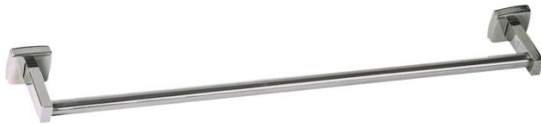
The image corresponds to 09027.B