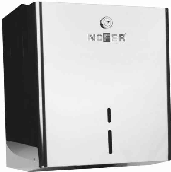
The image corresponds to 04098.B