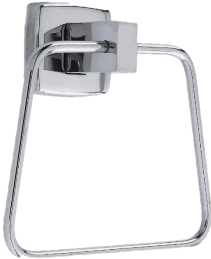
The image corresponds to 09047.B