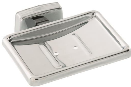
The image corresponds to the code 09044.B